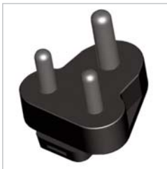
11 Under Development*

SPECIFICATIONS MAY CHANGE WITHOUT PRIOR NOTICE. CONSULT GLOBTEK CUSTOMER SERVICE FOR LATEST SPECIFICATIONS.